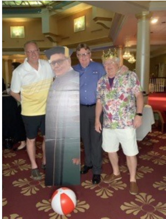
A fun send off fit for a King