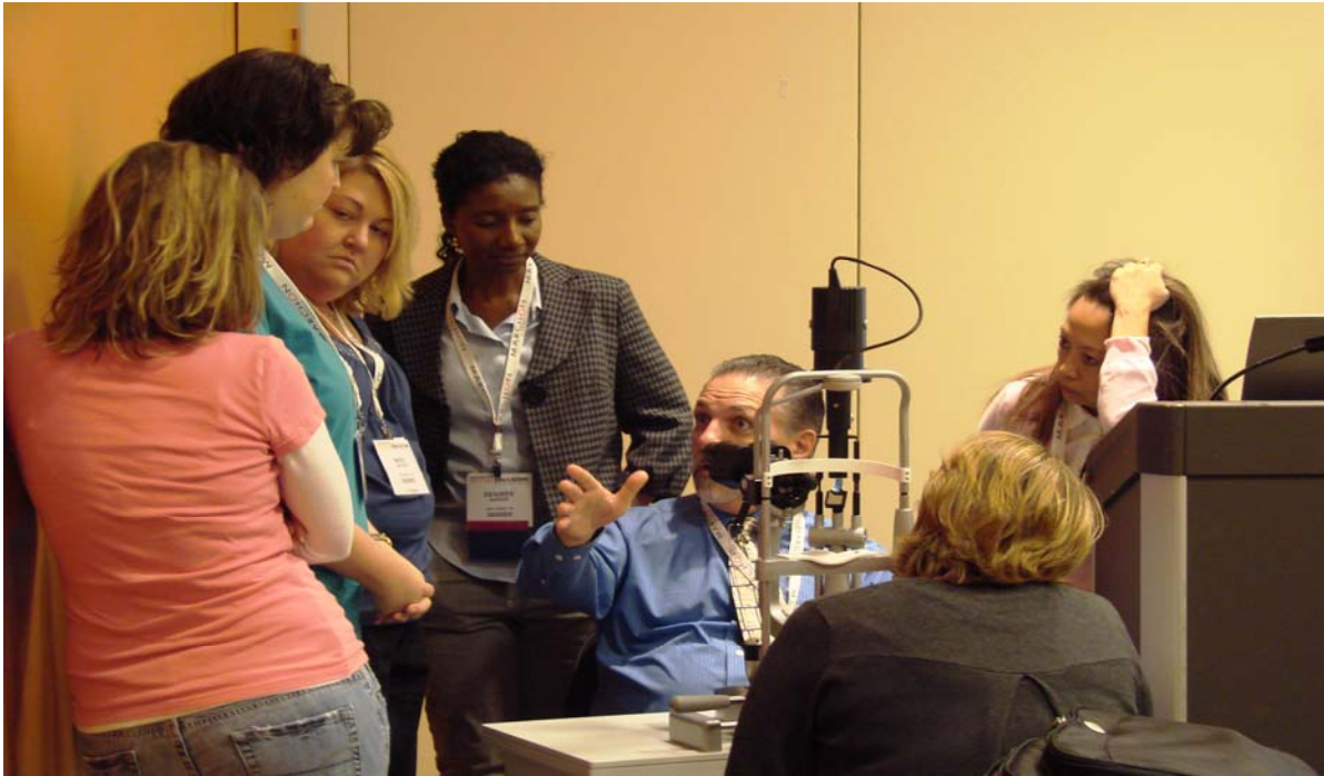
ABO-NCLE National Education Conference “Hands on Sessions”