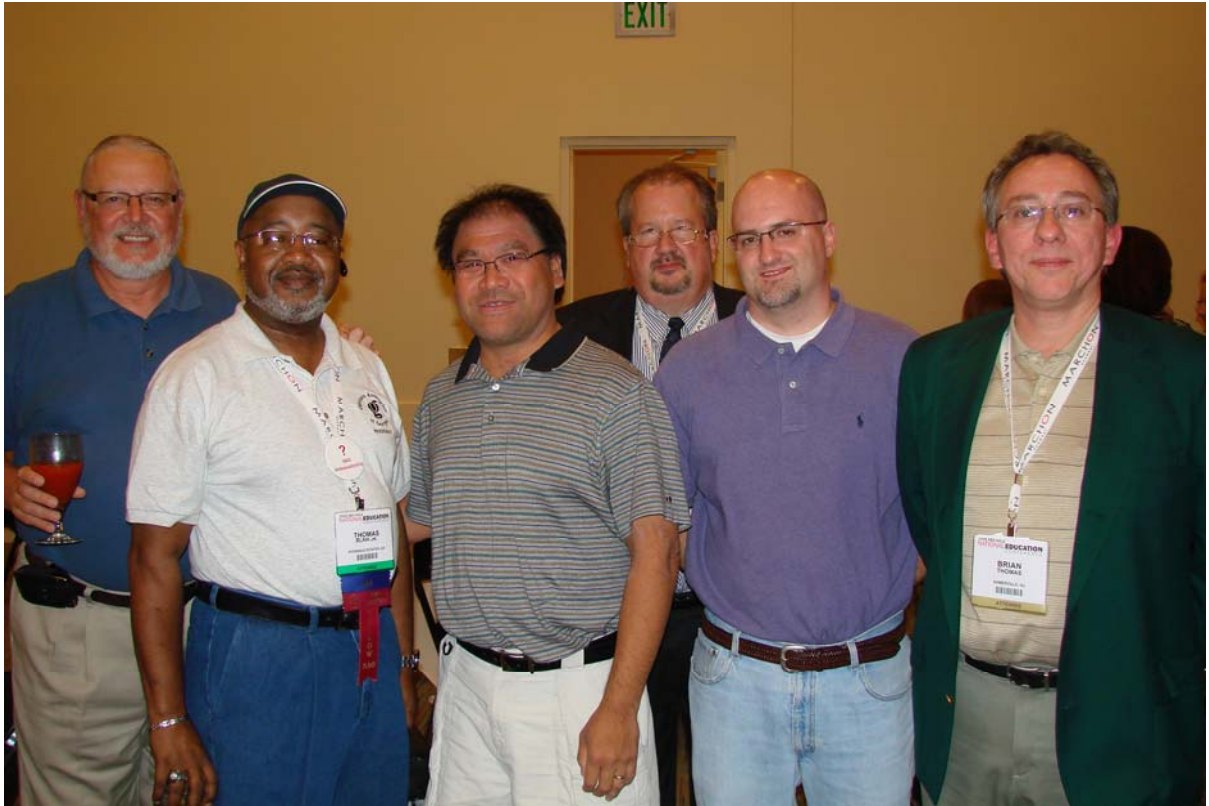
Our bespectacled NFOS friends