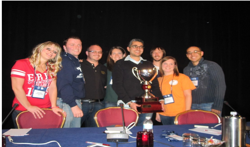
2012 Essilor Opticianry College Bowl contestants