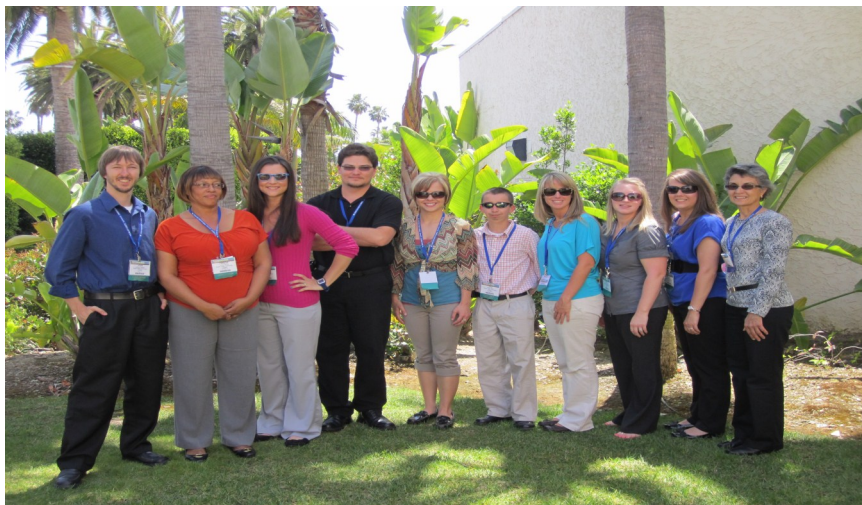
Scholarship winning Roane State students with their instructor in Newport Beach, California for the Contact Lens Society meeting